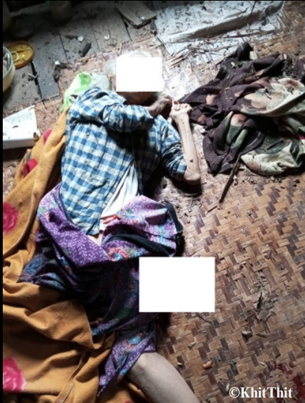
On June 17, 2025, military terrorists launched artillery attacks on Bago Region, Minhla Township, Hparlaykwin Myauk Su Village killing a retired headmistress aged over 80