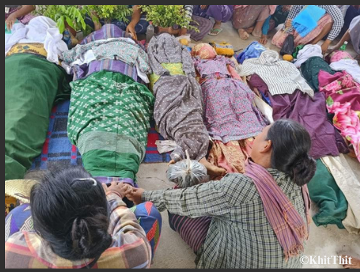
On May 12, military terrorists carried out an airstrike on a school in Oh Tein Twin Village, Depayin Township.

“92 women were killed due to airstrikes and ground attacks by military terrorists ”