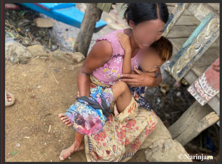
On May 13, military terrorists carried out an airstrike on Htun Ya Wan Old Village in Rathedaung Township.