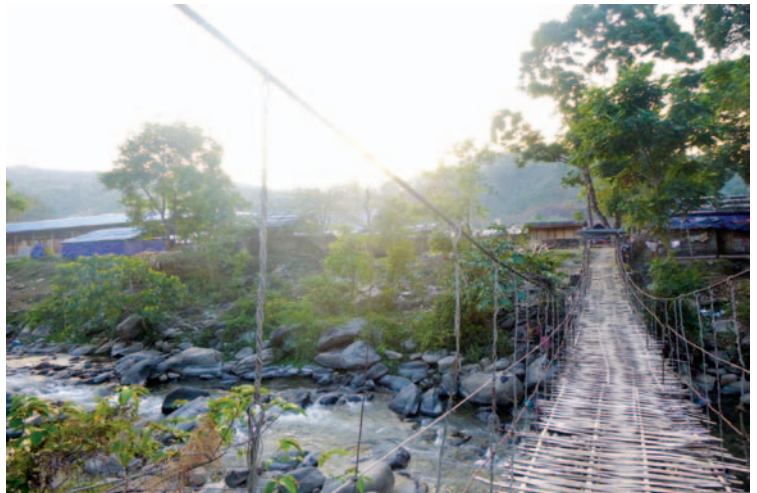
The way across: A wooden bridge links a camp to China

The 17-year-old daughter of an IDP woman was persuaded by her uncle to travel to China while her mother returned back to her village. She ended up being sold as a bride to a Chinese man. Her mother described what happened: