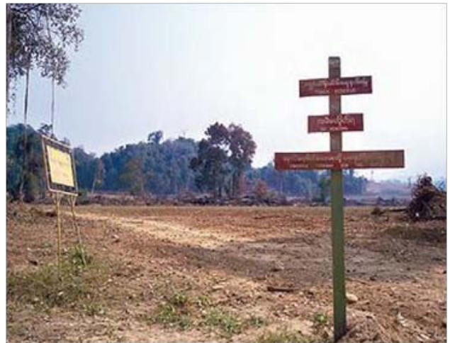
Clear-cut destruction: Lands in the Hukawng Tiger Reserve in Kachin State, including small local farms, were confiscated and razed to make room for commercial sugarcane, tapioca, and jatropha plantations.

Today, the same factors contributing to the problem of trafficking remain, but are exacerbated by the presence of conflict and the massive displacement that has resulted from it.