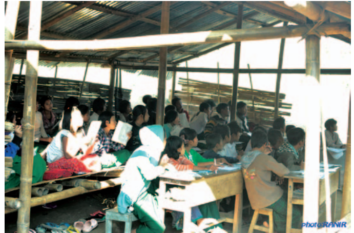
Close quarters: IDP children gather for their studies

This has been a disincentive for children to attend school. According to the mother of the 11-year-old IDP girl who went missing on the China side: