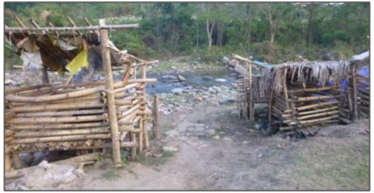
A stone's throw away: Informal border crossing from an IDP camp to China

The inability for most IDPs to access border passes to legally look for work in China is a major risk factor for human trafficking.