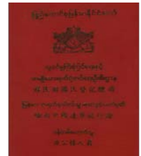
Hard to pass: Border passes for legal travel are nearly impossible for IDPs to access