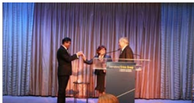
Pursuing peace? In April 2013, the number of Burmese government troops increases in Kachin State (above) while Union Minister U Aung Min receives the ‘In Pursuit of Peace’ Award from the International Crisis Group on behalf of President U Thein Sein (below).