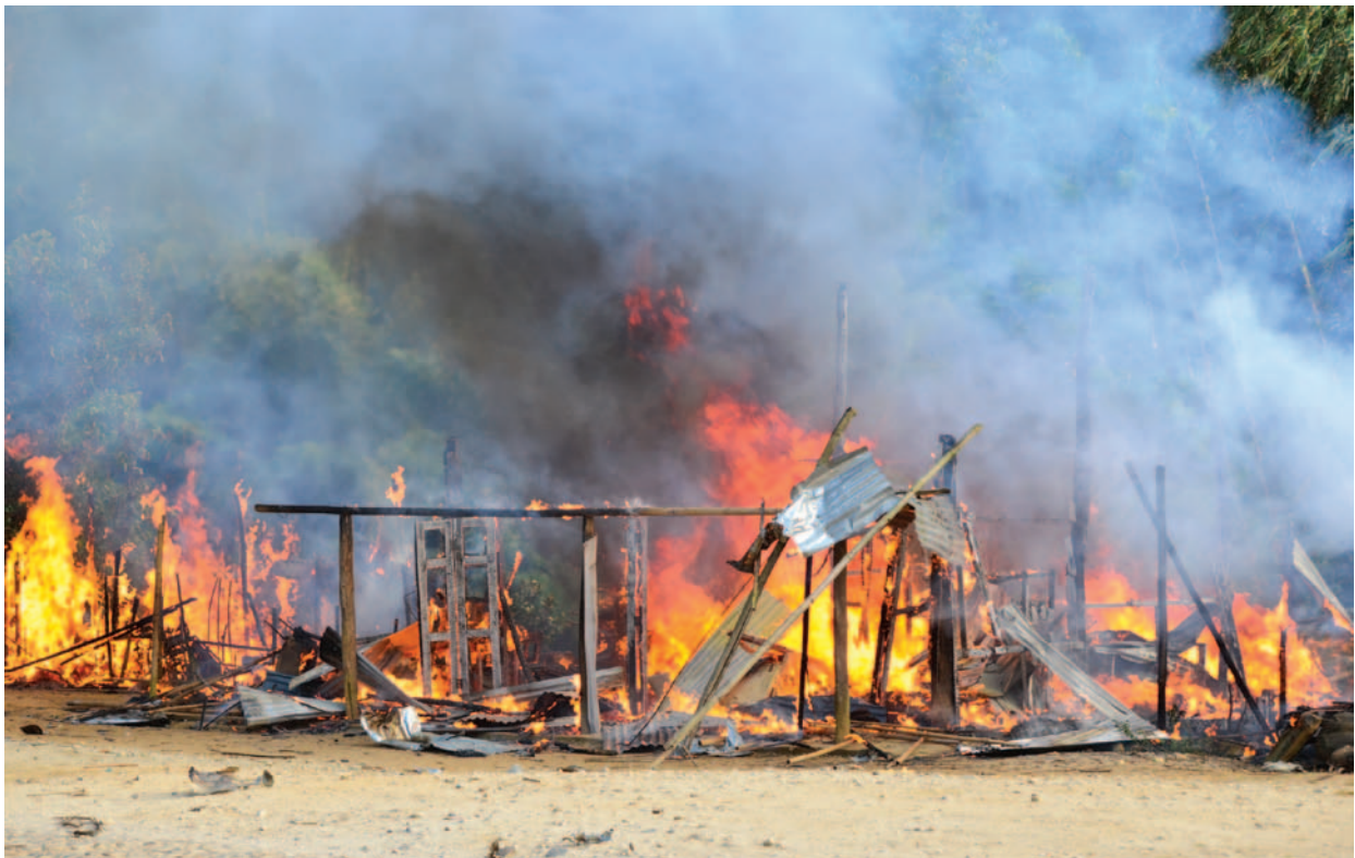
Burma Army air strike: A house in Kachin State burns after being hit by a bomb dropped by Burmese Army forces.