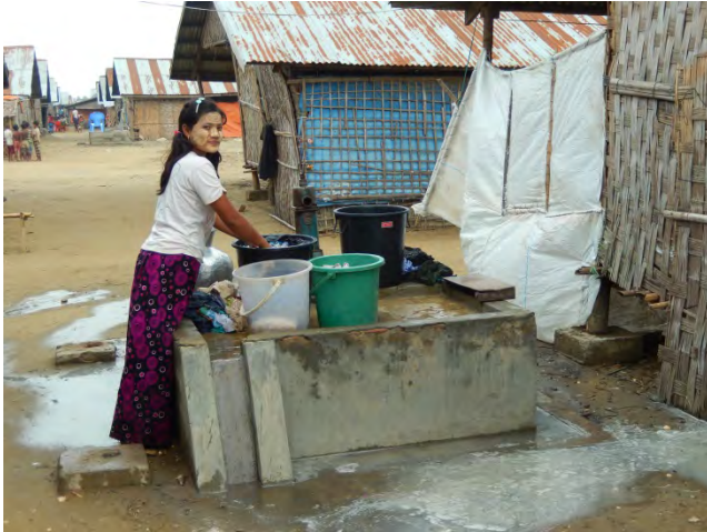
Rohingya women and girls in IDP camps near Sittwe (May 2016)