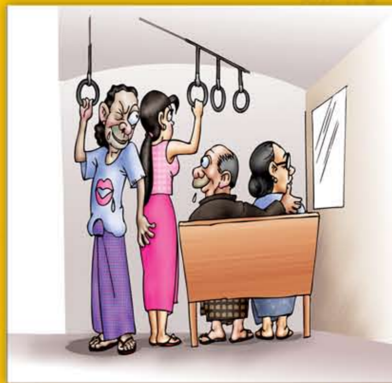
Hkum hkrang hpe hkra ya jum ya ai lam