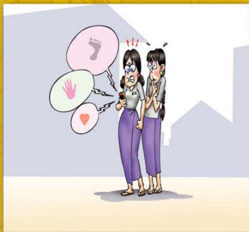
Phone hku na num la ganawn mazum ai lam ni hpe madat n wawm hkra tsun shaga ai lam