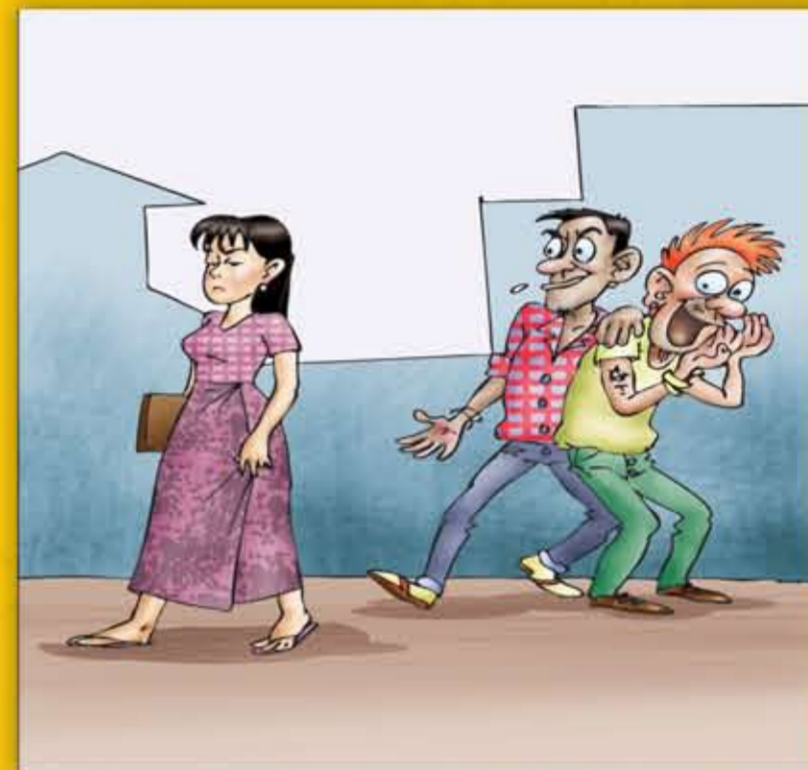
Hkumhkrang hpe yu na n se n sa ai myit hte asawng asang tsun shala ai lam