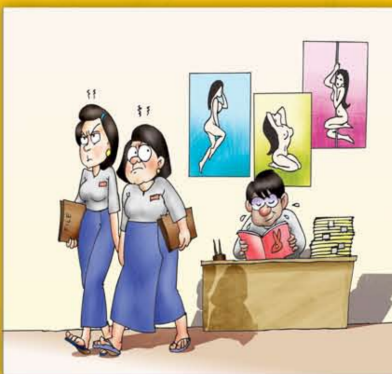
Masha mu mada ai shara ni hta myu shayi ni a gawng shingyan dawshan ni shadan tawn da ai sumla ni hpe madun da ai lam