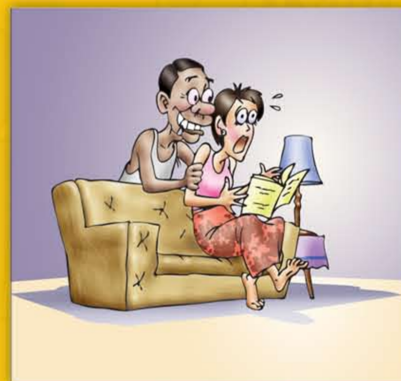
Sha la ai zawn rai nna amyat htuk ai lam