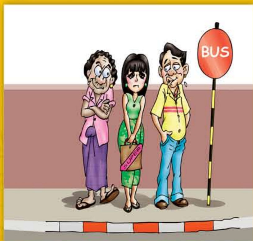
Ngang ai myi hte yu ai lam