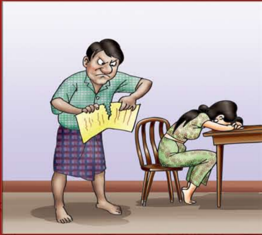
Dinghku n jahka ya ai sha jahkrit shama ai lam