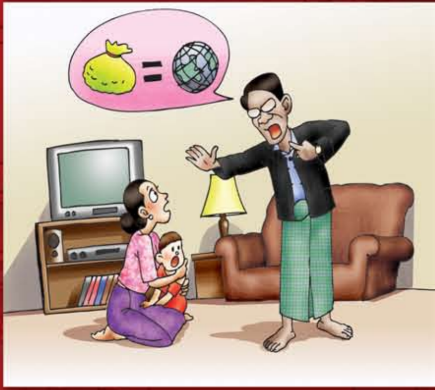
Madu jan hpe shinggan shang gumhpraw tam na matu hkum pat ai lam