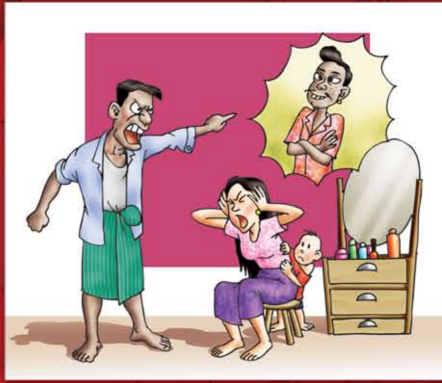
N teng n man ai hpe shadu, tsun ai lam