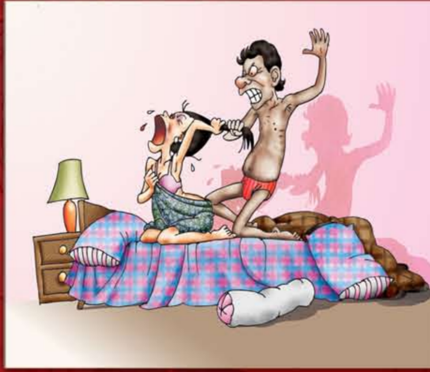
Roi rip, zing ri nna hkumshan ganawn na matu shakut ai lam