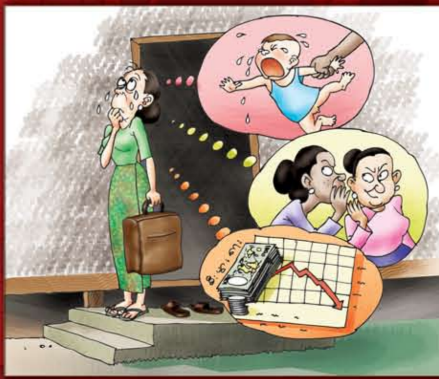
Roi rip hkum sha ai madu jan ni gaw dinghku bra na hpe grai hkrit tsang ai lam