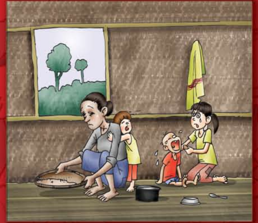
Dinghku masha ni hpe n bau ai, n garum ai lam