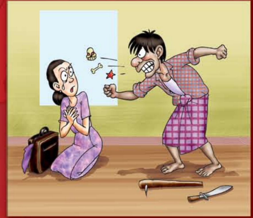
zai ai, kinsha lasha ga ni hte tsun shaga ai lam