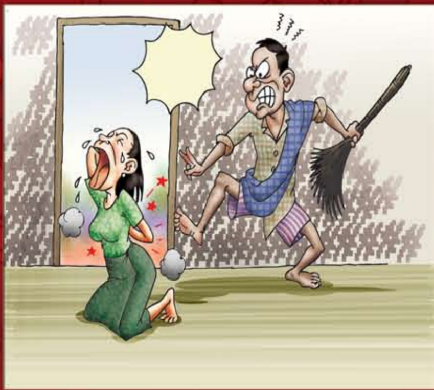
Adup abyen ai lam