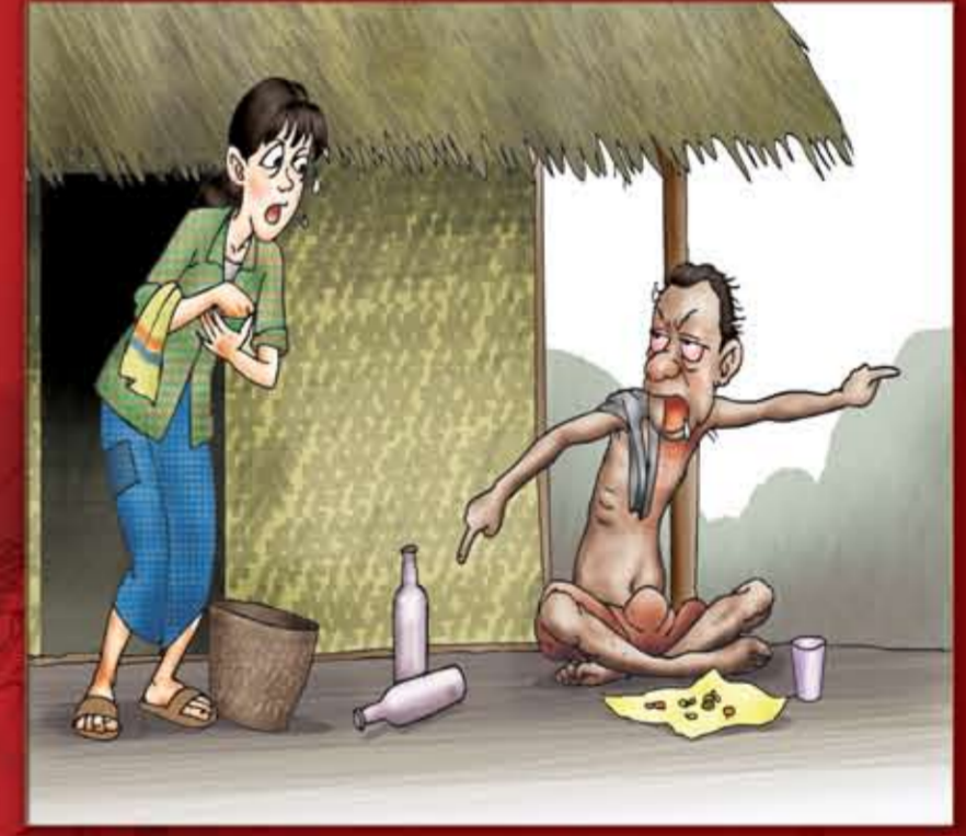
Madu jan a shang gumhpraw hte sha nga lawm ai, majoi lu sha jai shama ai lam