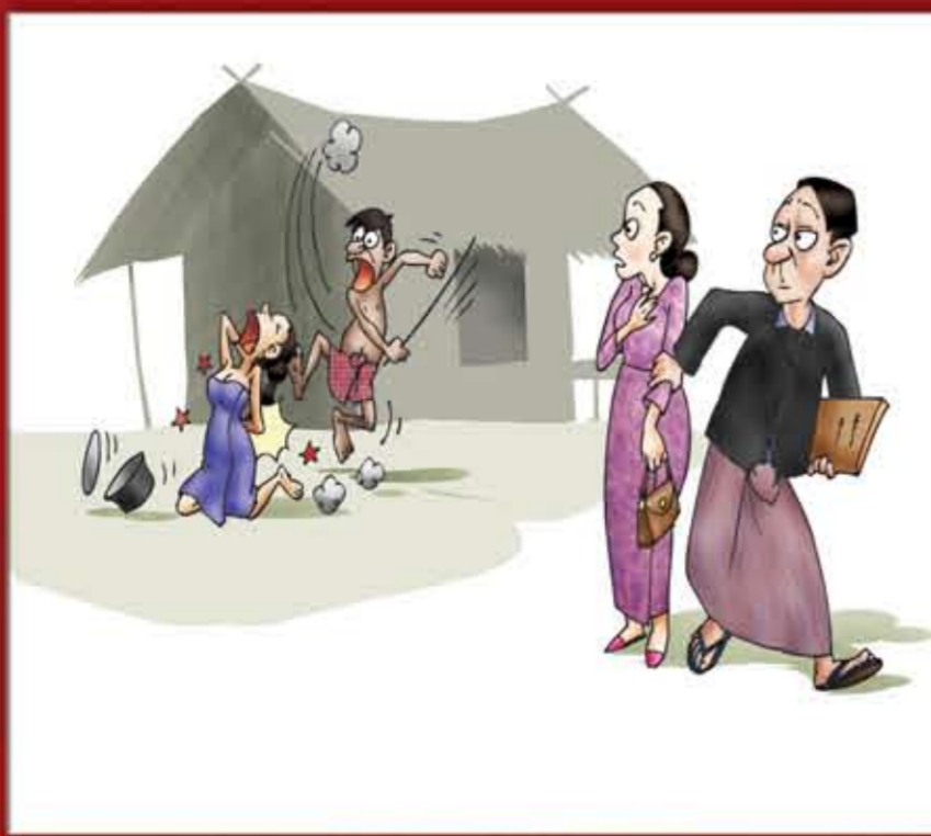
Makau grupyin ni kaw nna dinghku kata na manghkang re ngu sha htang la ai lam