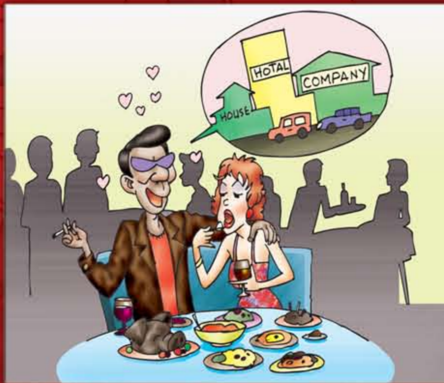
Mayun sumtsaw tawn ai, hpang dinghku de ai lam